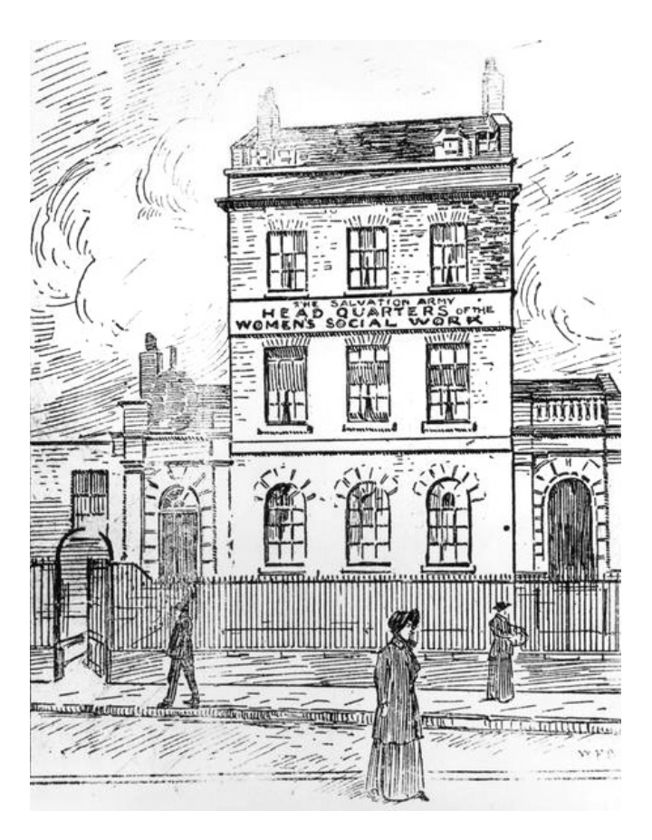
The Salvation Army's Women's Social Work department moved into the spacious quarters at 259 Mare Street, Hackney, in 1887, moving to purpose-built headquarters constructed at 280 Mare Street in 1910.